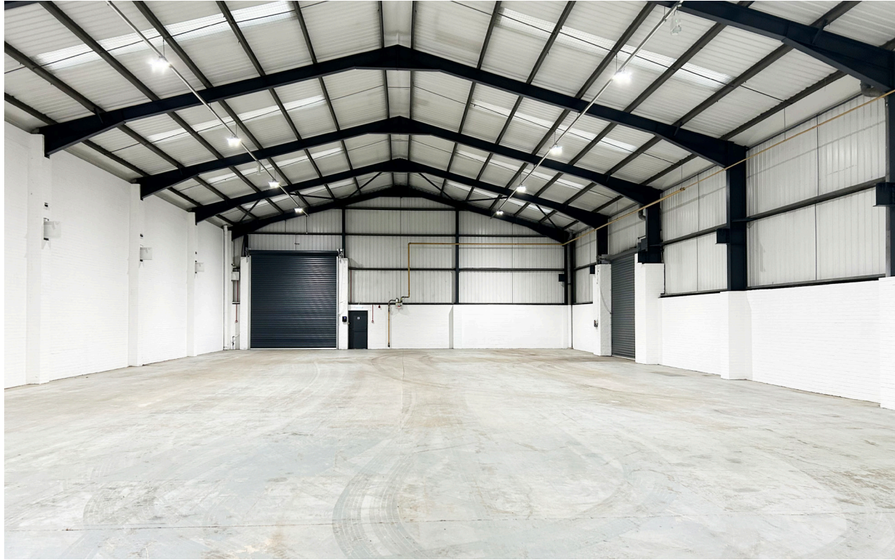
Block B Bay 1, Multipark Stourbridge, Stourbridge, West Midlands, DY8 1JN